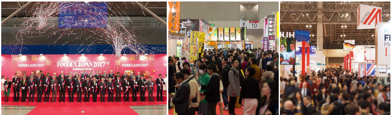
Opening ceremony with foreign dignitaries(left), 82,434 buyers were attended in 2017 (center, right)