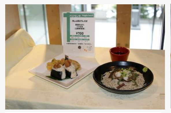
Veggie Lunch JPY700 Chilled buckwheat noodles with wild vegetables and grated radish , vegetable tempura, soimusu