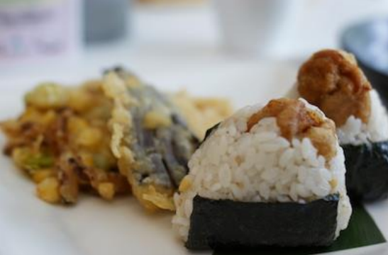
The photo shows soimusu at the front and vegetable tempura behind

The dipping sauce for the buckwheat noodles uses stock made from kombu kelp and shiitake mushrooms. The tempura consists of squash, eggplant, and lotus root as individual items, and a mixed fry of broad beans, onion, bitter gourd, and sweetcorn. The soimusu, made with soy meat, was making its first appearance as an official menu item after being commercially developed.