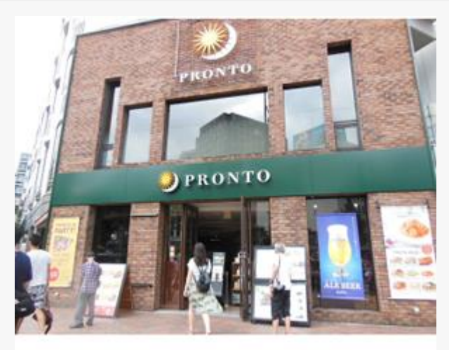
PRONTO introducing new tea menu

"Single Estate Ceylon Tea Sri Lanka Farm" from November 2014. "We want to offer a way 3 of enjoying tea time with black tea" they commented. This new product is a non-blended tea that only uses leaves harvested in farm of Sri Lanka. The stores serve tea in a teapot, which allows customers to enjoy the rich flavor and natural soft sweetness.