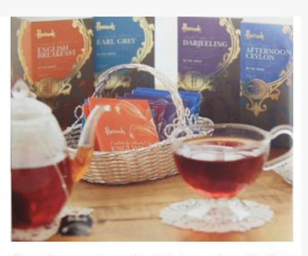
Harrods, a popular and widely known brand in Japan

Black tea was first imported to Japan in 1887 at a low volume of 100kg. The tea was not imported from China, but from England due to the adoration Japanese people had for European culture. Black tea was cherished by the upper class Japanese as a culture that was equally valuable to the traditional Japanese tea ceremony. Black tea consumption in Japan has grown significantly since then as tea bags and canned tea were introduced to the market. Recently, consumers are showing greater interest towards tealeaves and the benefits of black tea is being reviewed. More people are drinking tea as a fashionable and healthy item that brings relaxation to their busy days.