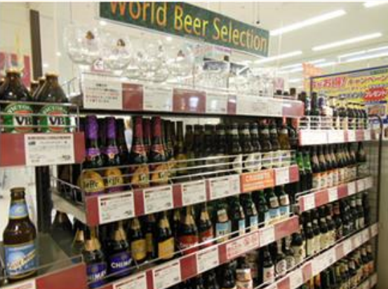
A section selling world beer under the banner: World Beer Selection

Premium products are expanding in the current Japanese beer market and interest towards new beers from the world is also inflating. Domestic and imported craft beer is also receiving remarkable attention. Craft beer is growing at the rate of about 20% and is getting more space on the shelves of supermarkets. Gift proposals are the biggest core. In addition to new proposals for local (craft) beer that can be differentiated from other types of beer, the stores have high chances to become more vitalized. Not only cheap products, but also high value added products should be introduced, and this is more preferable for imported beer to become established in the sales floor. According to an estimate by Suntory, the premium beer market that was 10.78 million cases in 2003 expanded to 30 million in 10 years. An industry source predicts that premium beer's popularity will continue and become stabilized in the future. This is a plus for companies that are considering exporting beer to Japan.