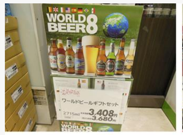
World beer gift set in association with the World Cup was popular this summer.

\diamond While there were 34 new products introduced by domestic beer makers to the Japanese market in 2013, there are already 40 items introduced this year as of August. New, unique, and different beers are demanded.